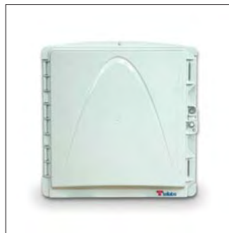
Figure 3. Optional outdoor enclosure