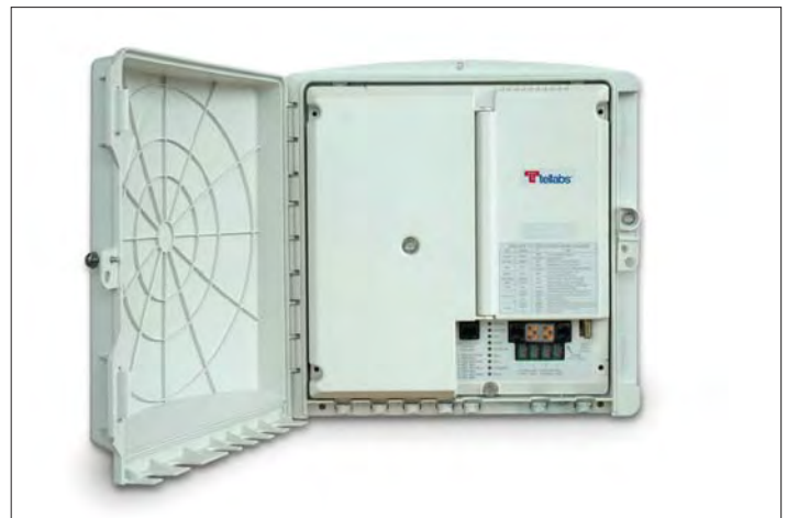
Figure 1. The Tellabs® 1600-703 GPON ONT

The Tellabs 1600-703 GPON ONT supports management via the ITU G.983.2/G.984.4 OMCI interface to a Tellabs Optical Line Terminal (OLT). Deployed with a Tellabs OLT, the Tellabs 1600-703 GPON ONT can be managed by the Tellabs® 1090 Network Management System* or the Tellabs® 1191 Network Management System.